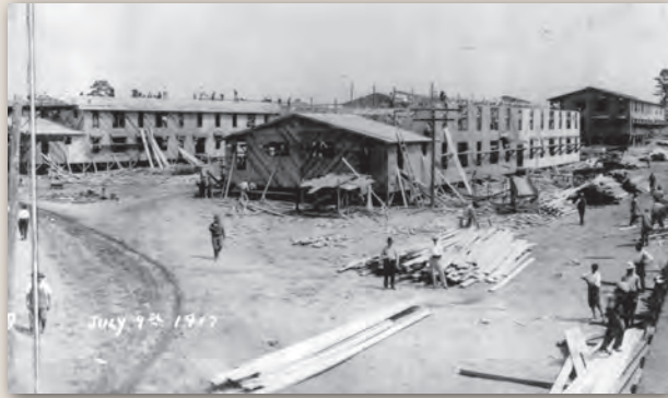
10,000 workers had the camp ready for troops by September 5, 1917.