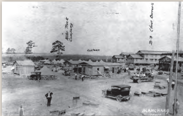
Early construction at Camp Jackson, July 1917.

Join us as we explore some of these topics and learn more about the impact this global conflict had on a small southern state.